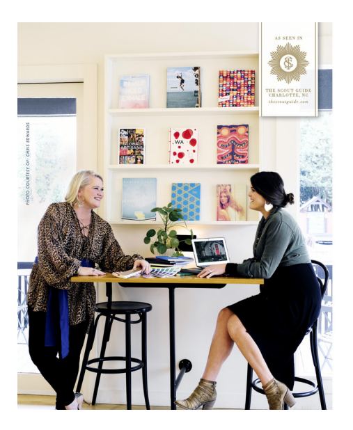
The Scout Guide Editor's Page